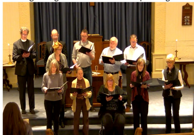
Combined choir voices from the three churches. Singing “Jesus Calls Us” together and with the congregation.