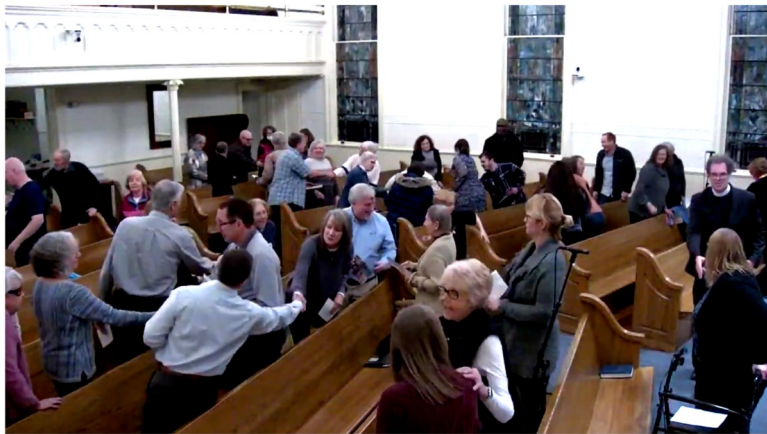
Passing the peace— greeting those we knew and acquainting with new.

in collaboration with Clover Hill and Neshanic Reformed Churches and our community families as well!